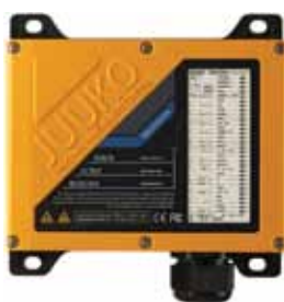
HS series 190 X 184 X 64 mm 1800g