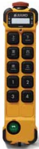
K1000 242 X 57 X 51 mm 389g*