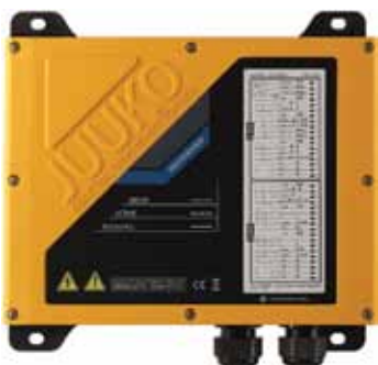
HM series 272 X 260 X 96 mm 2950g