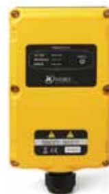
W series 188 X 120 X 65 mm 1595g