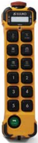
K1200 242X 57 X 51 mm 389g