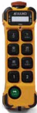
K800 193 X 57 X 51 mm 325g*