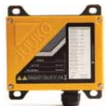
H series 142 X 141 X 59 mm 403g