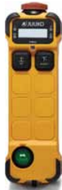
K200 193X 57 X 51 mm 325g*