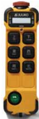
K600 193 X 57 X 51 mm 325g*